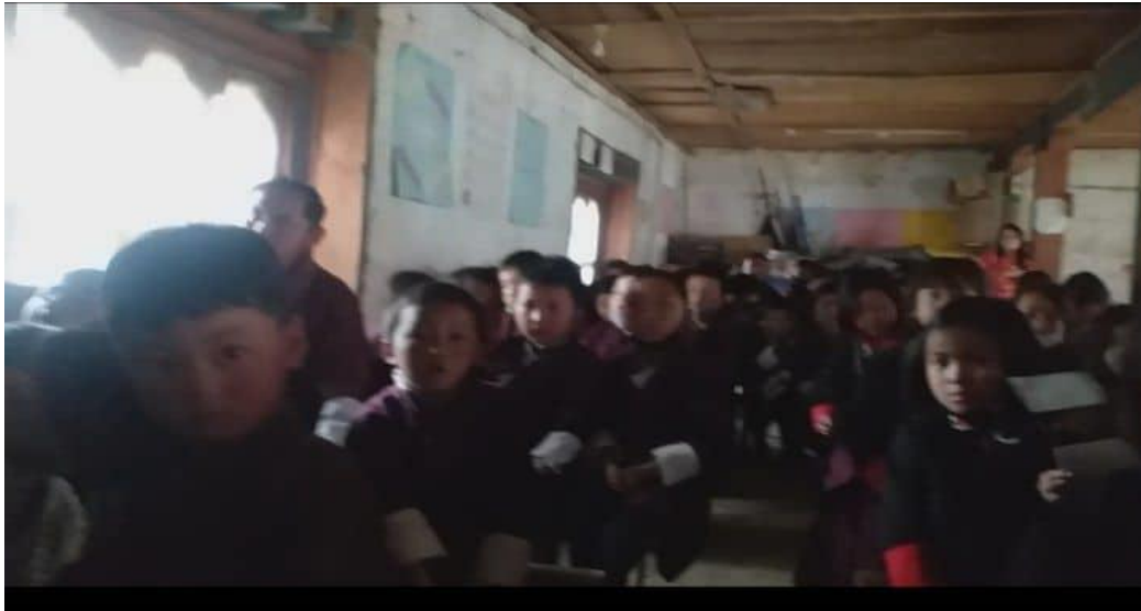
Student watching documentary film of the museum