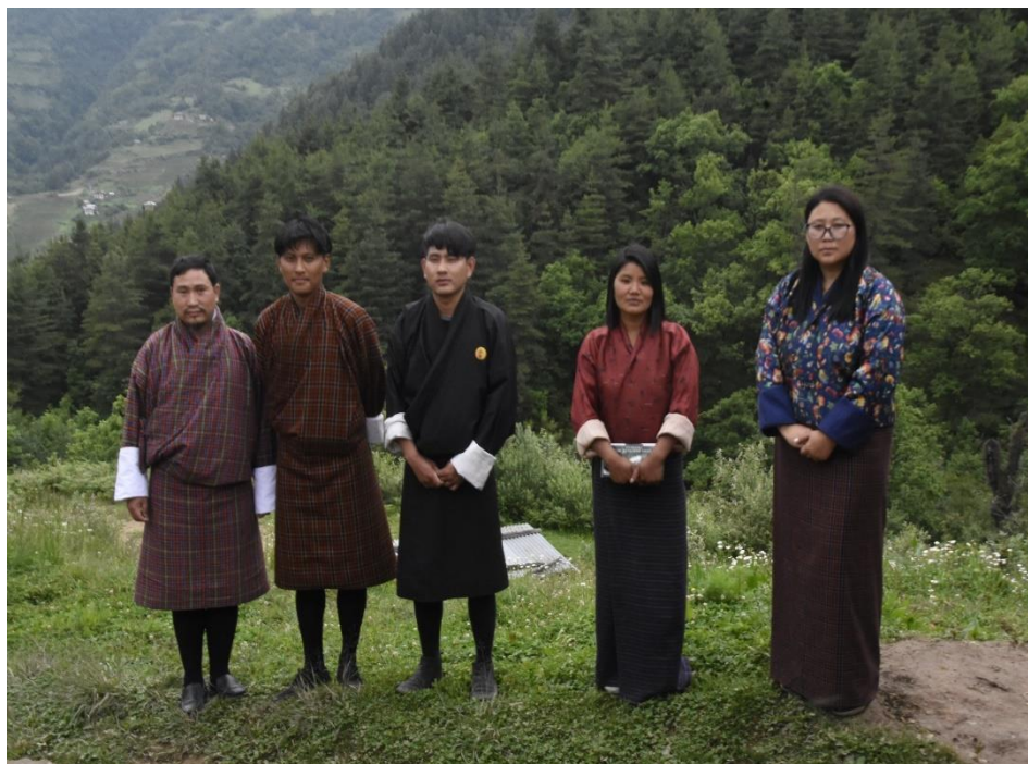
- Museum staff with Bemjee School staff.