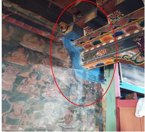
New painting after renovation